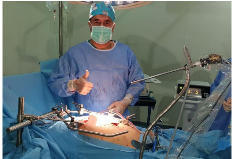
Note use of Monolithic FlexArm for scope holding to allow viewing of the procedure by the surgical team